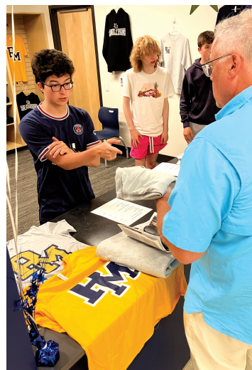
A student waits on a customer at the new Penn Manor HS Store.

Power Packs operates year-round from the Loft Community Partnership, located in Millersville.