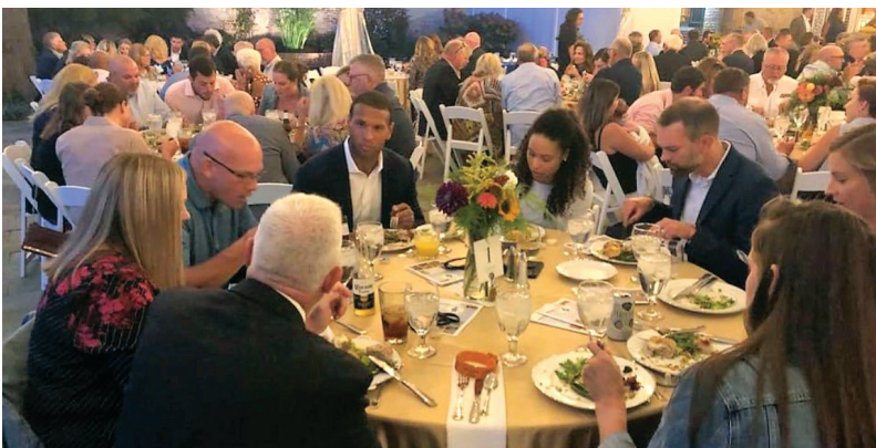
Drumore Estate will again host our Annual Dinner, on Sept. 24