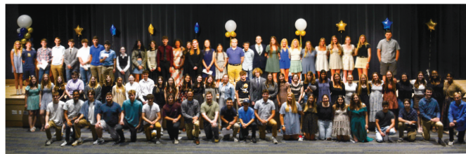
The Foundation awarded a record number of scholarships to members of the Penn Manor High School Class of 2023.