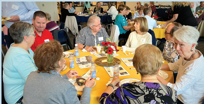
Penn Manor employees, past and present, get caught up at the May 10 breakfast.