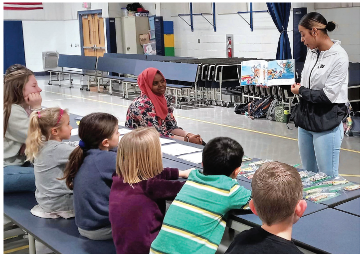
A member of the high school's Civitas Club reads a book to elementary students during the Readathon, which visited all seven Penn Manor elementary schools.

A $600 grant paid for services to assist ESL students, and a $200 grant paid for