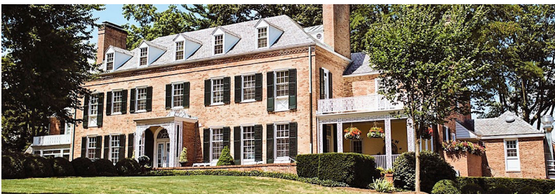
Drumore Estate will again host our Annual Dinner, on Sept. 25