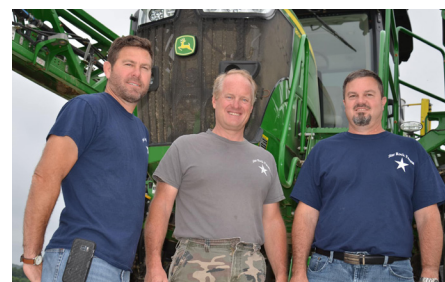
Barley family members