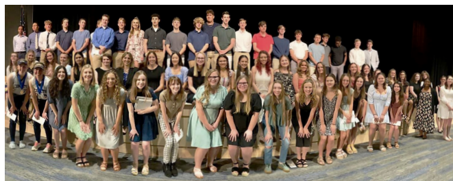
The Foundation awarded a record number of scholarships to members of the Penn Manor High School Class of 2022.

Listed below are this year's recipients, along with their intended plans following high school.