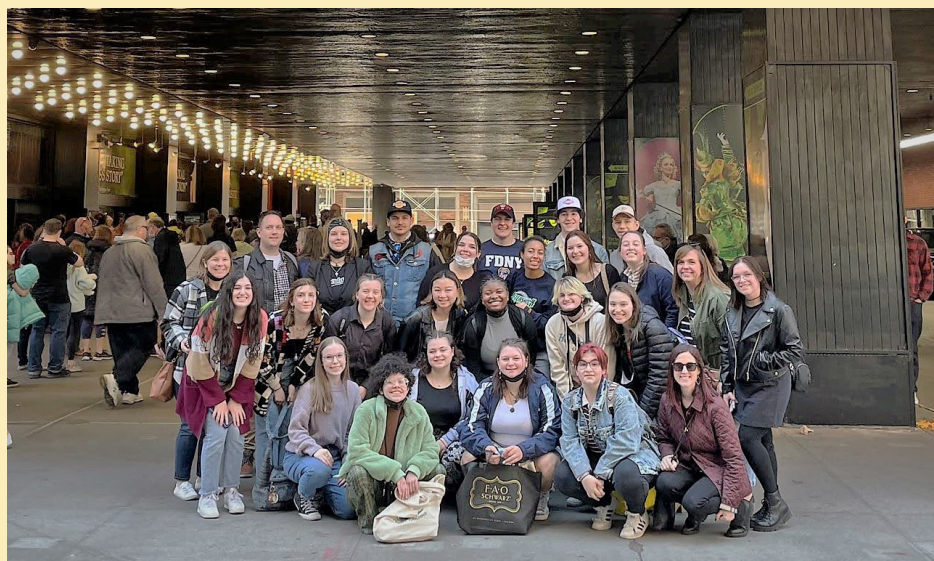
Penn Manor senior music students and chaperones pose outside the Gershwin Theater during a tour of New York City, which included the Broadway show, "Wicked."

The next day, the students and their chaperones visited the Top of the Rock Observatory at 30 Rockefeller