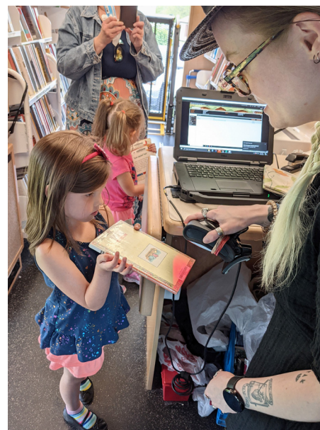
A youngster checks out a book from the Lancaster County Bookmobile, which was parked in the Pheasant Ridge neighborhood during the Literacy Project event.

A $5,000 grant was used to purchase uniforms, tools, supplies and certification fees for students who attend Career & Technology Center programs.