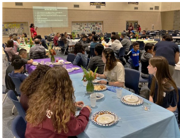
Participants and volunteers listen to a presentation at a Family Fun Night in the cafeteria of Penn Manor High School.