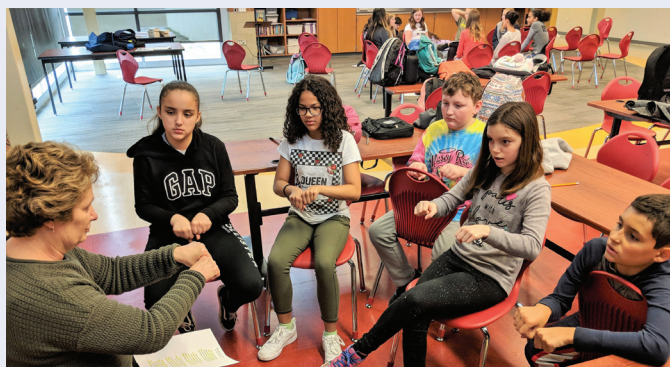
Hambright Elementary students practice their vocabulary during Sign Language Club, a new after-school activity.