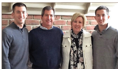
The Rintz family