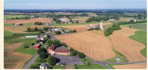
A drone captured this aerial view of farmland for agricultural education students to study.