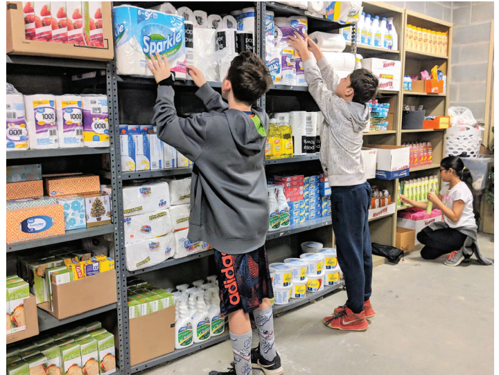
Students help stock the PM C.A.R.E.S. pantry with household supplies at Hambricht Elementary School.

from low-income families for commencement.