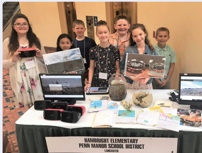
Hambricht Elementary students, above, display their project, “The World in Our Backyard,” during the Student Technology Showcase in May at the state Capitol. At left are some of the animal bones they discovered while researching their project.