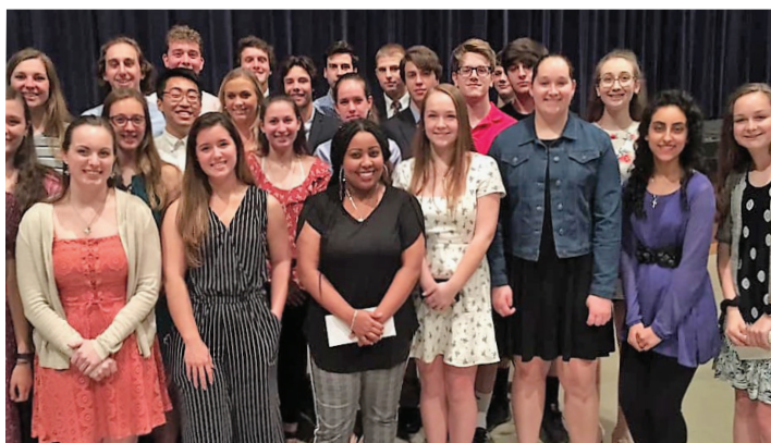
Some of the recipients of 2019 scholarships administered by PMEF.