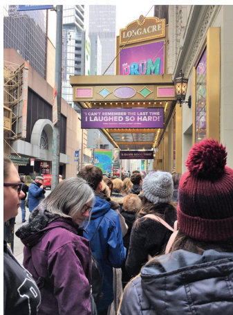
Students and chaperones head to the theater.

for helping to provide this rewarding experience for our students!