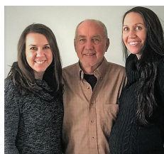
The Frerichs family

The Frerichs family understands the value of education and the importance of quality teachers.