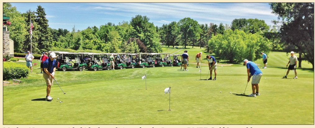
Mother Nature provided ideal conditions for the June 14 PMEF Golf Scramble.

We are proud to add this new initiative!