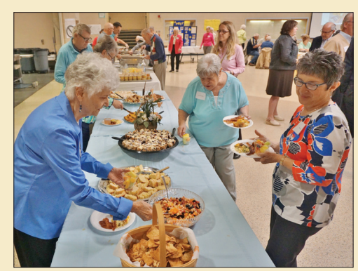
Retirees enjoy the annual breakfast, held May 3 in the high school cafeteria.