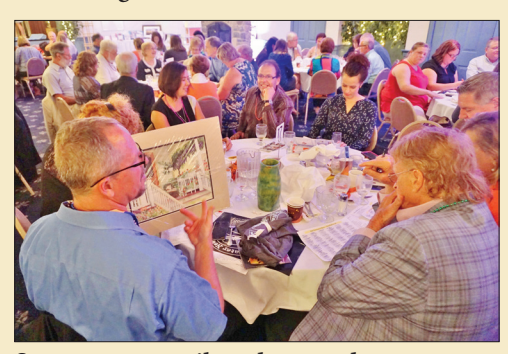
Supporters contributed a record amount at PMEF's Annual Dinner Sept. 18.

The Penn Manor community has truly gone "above and beyond" this year in supporting Penn Manor Education Foundation.